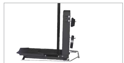
Pneumatic loading device