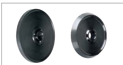
Standard clamping kit with 2 truck cones (198 – 225 mm / 270 – 286.5 mm)