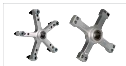
Professional clamping kit for stud-hole location of wheels with 4-arm / 5-arm star and 5 bolts