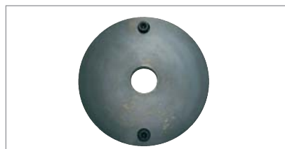
Pre-centring ring for light-truck wheels

For truck / light-truck wheels with pitch circle diameters of 170 / 184,15 / 205 / 222,25 / 245 mm