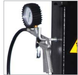
Pressure gauge for inflator