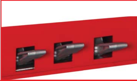
High ground clearance of foot pedals facilitate operation with steel-tipped boots