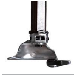
Mount / Demount Tool with plastic protection