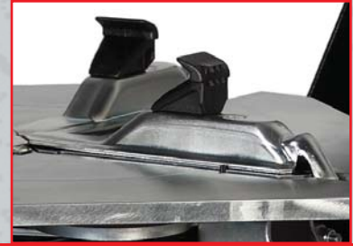
Tried, tested and proven clamps with plastic protection